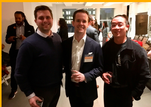
(Top): Associate Board members awarding the Associate Board Scholarships to two College Readiness graduates. (Middle): AB members preparing meals for Meals on Wheels. (Bottom): AB members and guests enjoying their spring fundraiser.

If you, or anyone you know, might be a good fit to join our Associate Board, please let us know!