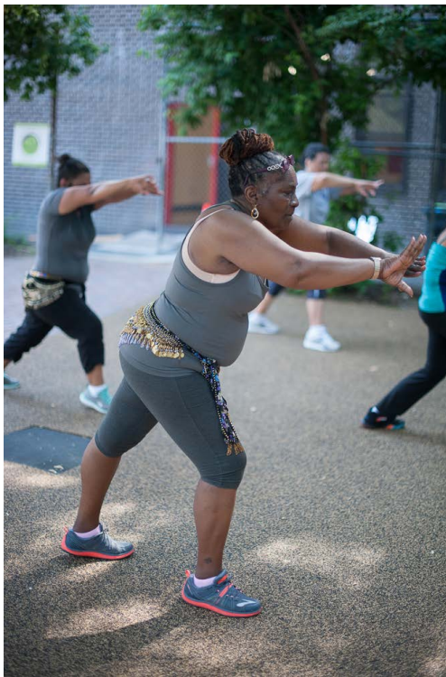
(Top): Outdoor senior Zumba class at Union Settlement. (Right): Our Senior Services participants enjoy a summer BBQ outing to FDR State Park in Westchester County.