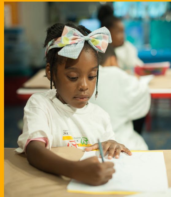
Student in Union Settlement's Rising Stars Program