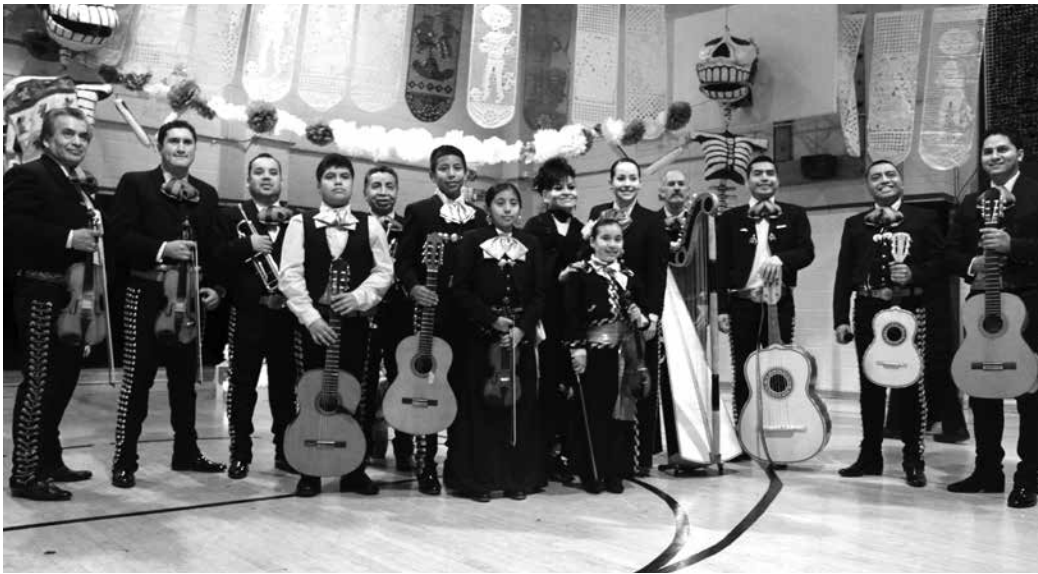
Scenes from Union Settlement's Annual Day of the Dead Thursday, November 1 st